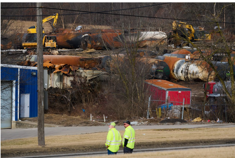
Crews worked on clearing the Norfolk Southern crash site in East Palestine, Ohio, on Feb. 14.

Some problems stem from rail-yard congestion as employees handle longer trains and workers sometimes must do work they have little training for, all under tighter time pressure.