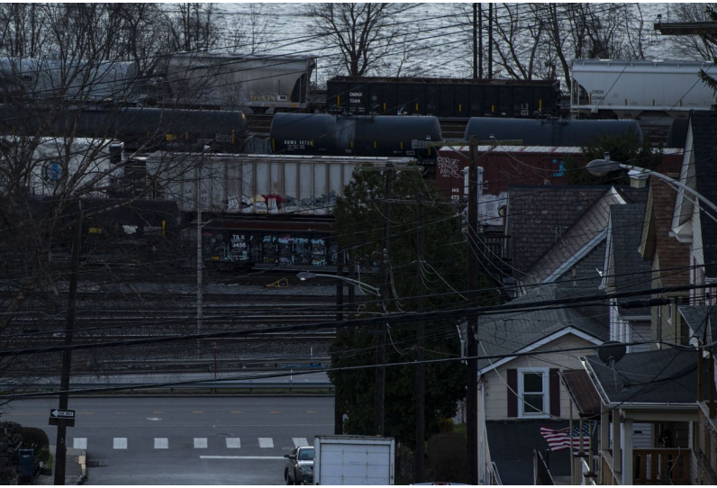
The Norfolk Southern Conway Railyard seen from a street in Freedom, Pa.